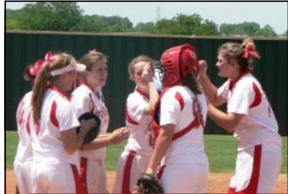
The Lady Lions show great pitching and defense to defeat the Lions of Blooming Grove in the Regional Quarterfinal series.