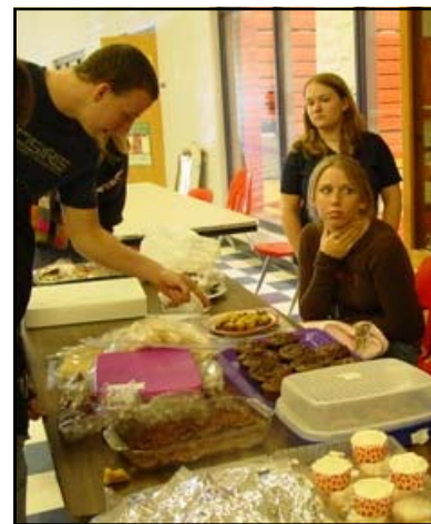
The ASL Bake Sale on May 17th raised money for the Goodrich Center for the Deaf.